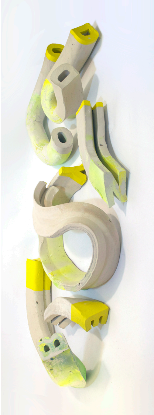
Type Extrusion: Beyond (2011) Series of three Earthenware and acrylic 28 x 18 x 12 in Keetra Dixon