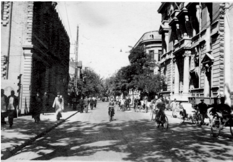
Victoria Road, Former British Concession, Tianjin, China, 1946